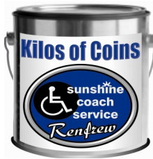
Kilos of Coins Collection Can

Our Kilos of Coins Campaign is aimed at gathering as many pounds / kilos of loose change as possible, from as many sources as possible. All coins gathered will be officially weighed at the Telethon on an industrial scale on-loan from Scott & Sons Hardware.